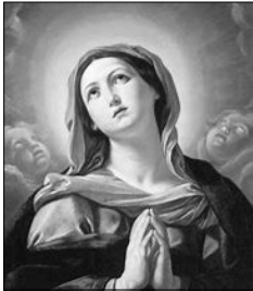
Holy Day of Obligation